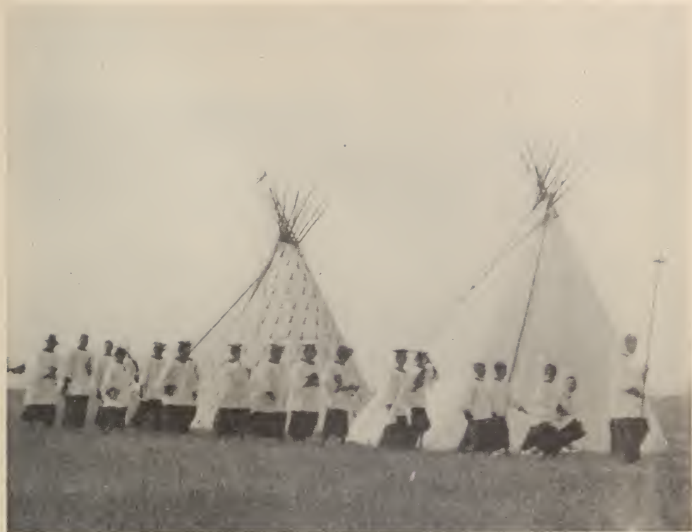
CLERGY LEAVING THE CHURCH

horseback, sending his clear, ringing call abroad to summon the people to prayer or conference. The two braids of his long hair, hanging over either shoulder in front, were tightly wrapped in long strips of red flannel, tied in streaming bows at the end of each braid; and his beaded moccasins and many-colored belt, together with his wand of office, helped to make him a striking figure.